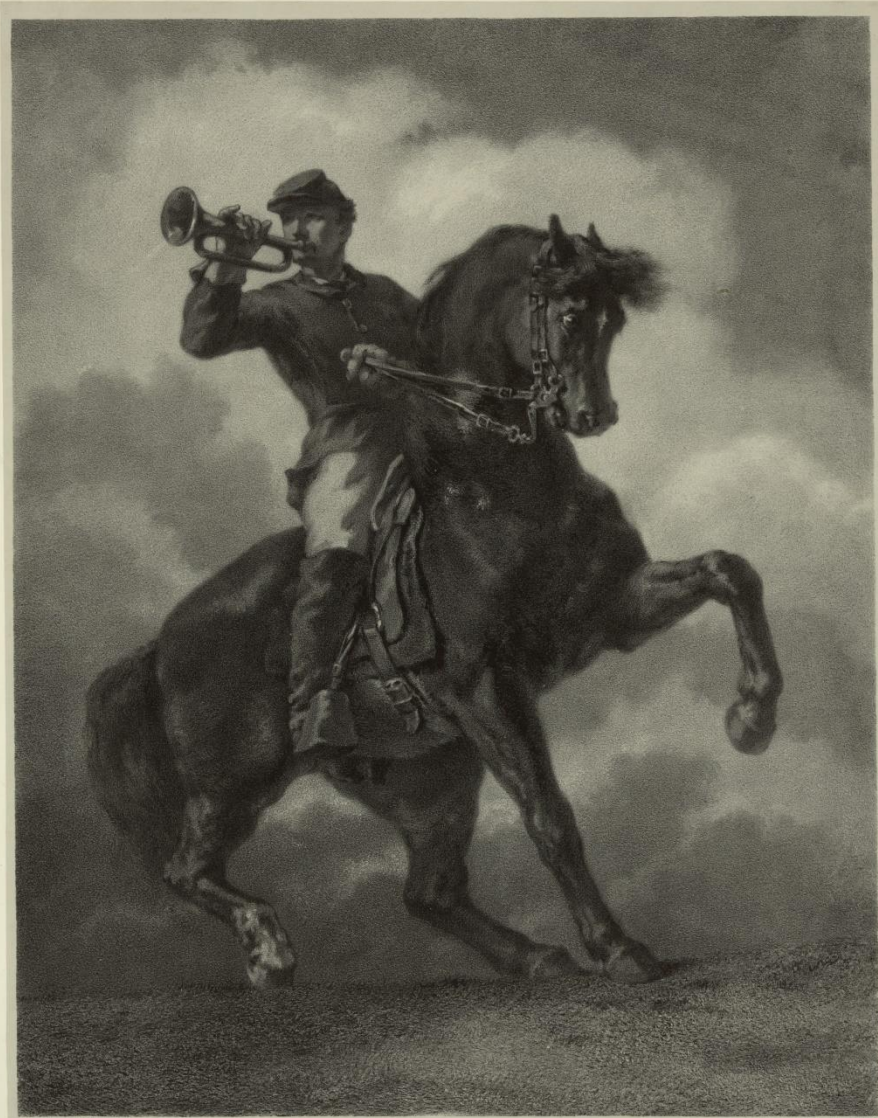
Painted by W. M. HUNT