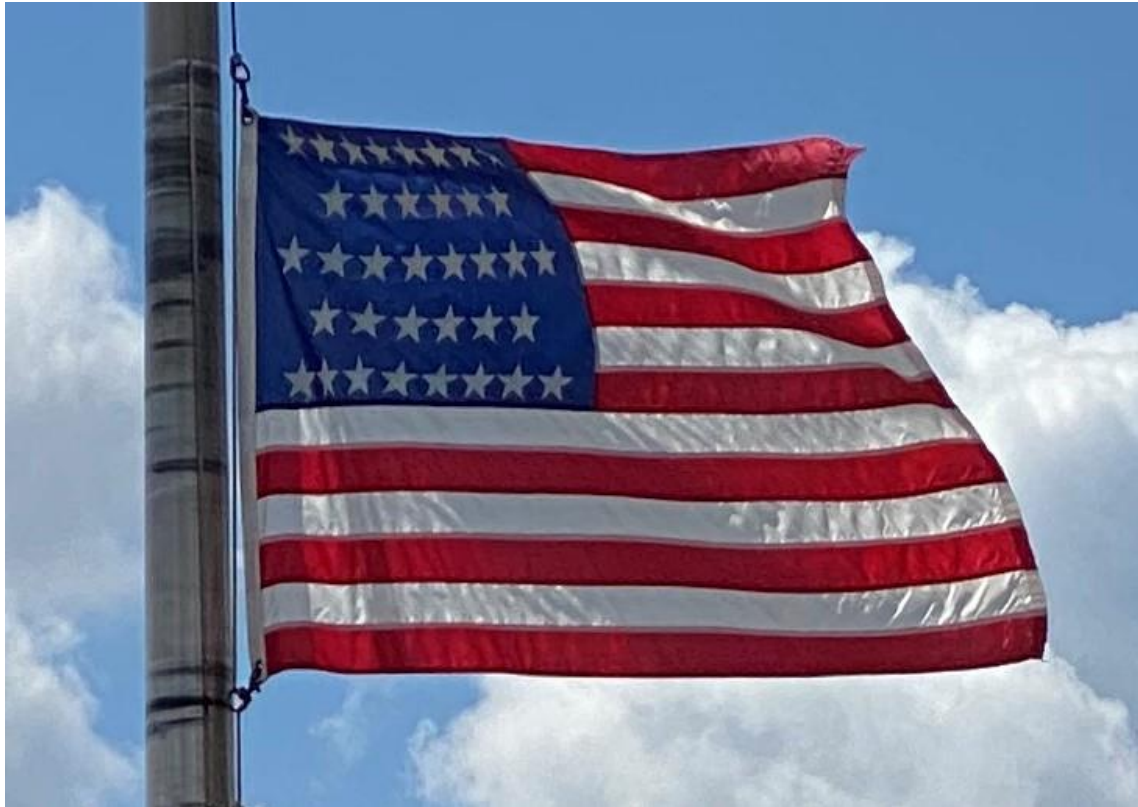
Treue Der Union Monument 347 High Street Comfort, TX 78013

It can be confusing to keep track of all the flags used during the Civil War. Both the Union and the Confederacy went through a variety of flags during the four years of battle (April 12, 1861 - April 9, 1865). The Union used the United States flag during the war which was a 36-star flag—in 1865—the year the war ended. The Confederate flags varied even more in design. The 36-Star flag has a special connotation for Texas and the Civil War. It is the flag that is flown next to the Treue der Union Monument in Comfort, Texas to honor the mostly-German immigrants who were killed as they tried to flee from Texas to join Union troops. The 36-star American flag for this monument was the first authorized to fly at half-mast in perpetuity.