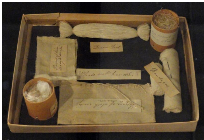
Civil War Bandage Exhibit

During the Civil War, manufactured bandages were often not produced quickly enough to keep up with the need. So, many mothers, wives, sisters, and sweethearts of the soldiers (North & South) would make bandages to send to the front lines and hospitals. These women would use sheets, bedspreads, old shirts, tablecloths, towels, petticoats, dresses, or any other material they could find. They would cut the fabric into strips and roll them up. A cloth bandage strip might've been washed and reused several times.